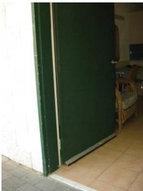
Level access into room

A desk is provided with a height of 750mm to the top of desk and a 715mm under clearance.