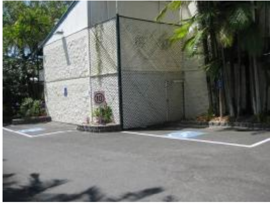
Accessible car parking