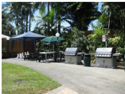
Pool and BBQ area