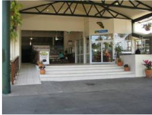
Undercover drop off area