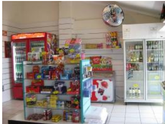
Convenience store within reception