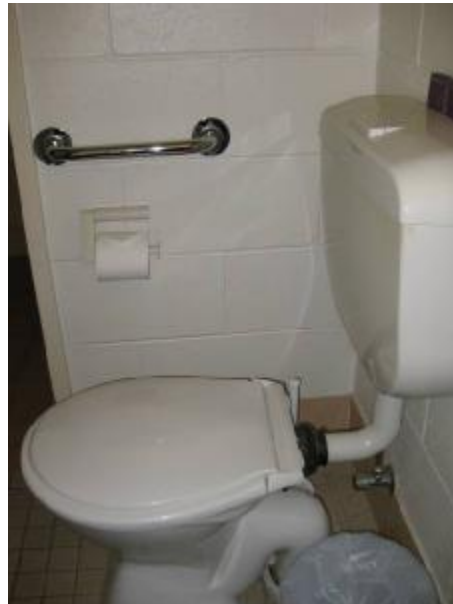
Toilet grab rail configuration