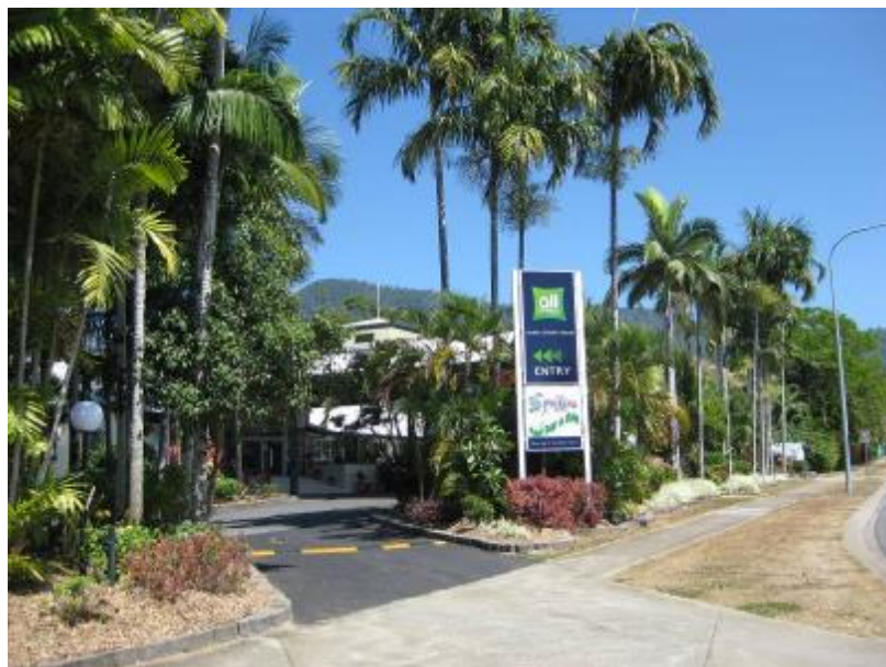
All Seasons Cairns Gateway Resort

Room numbers: Two accessible rooms, with no interconnecting rooms. Self contained with small kitchenette.