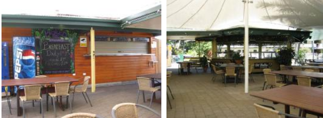
Bar and Cafe