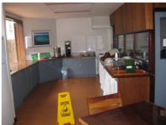
Dining room guest kitchen