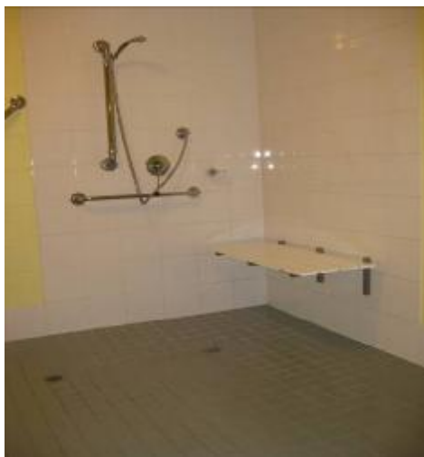
Shower and seat

Clearance to the under side of the sink is 620mm with a top height of 770mm. The base of the mirror from floor is 1040mm.