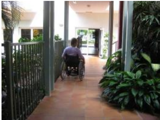
Path leading from reception to room

There is a 40mm threshold lip from the pool area leading into the dining room. Entry into the dining room from reception is level access and the door is very light and easy to push.