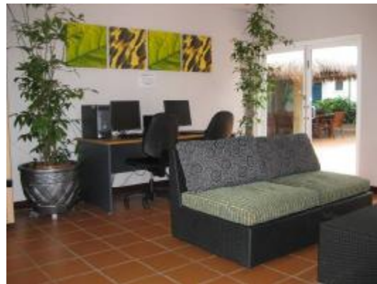
reception lounge and internet stations