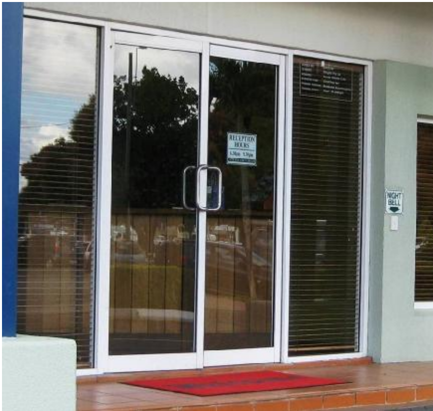
Coral Tree Inn Reception main entry (note 40mm lip)