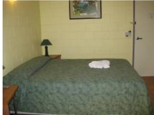
Main bed room