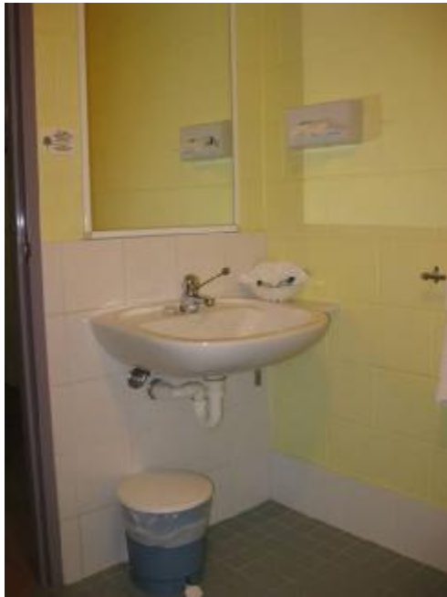
Sink and mirror