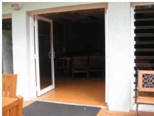
Entry into dining room from pool