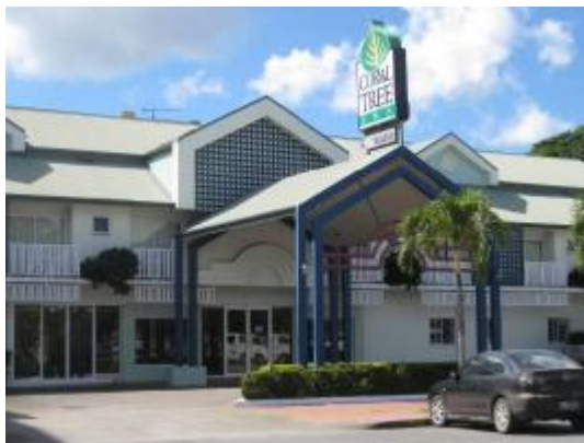
Coral Tree Inn

Reception is a large tiled level area with ample seating. The reception counter does not have a lowered section for wheel chairs but staff will assist guests if required.