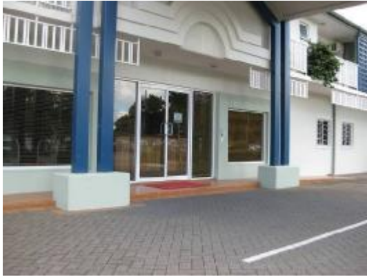
Drop off and main entrance