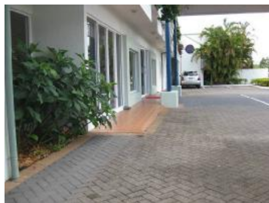
Ramp leading to Main Reception