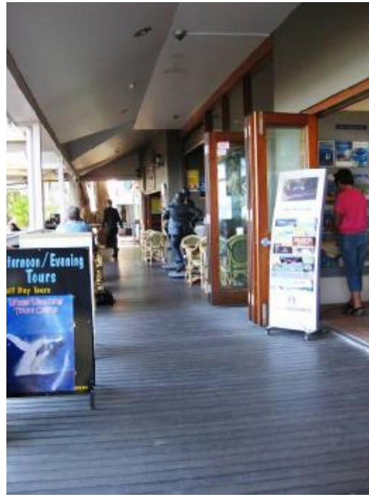
Front entry deck leading to Apres Bar & Grill