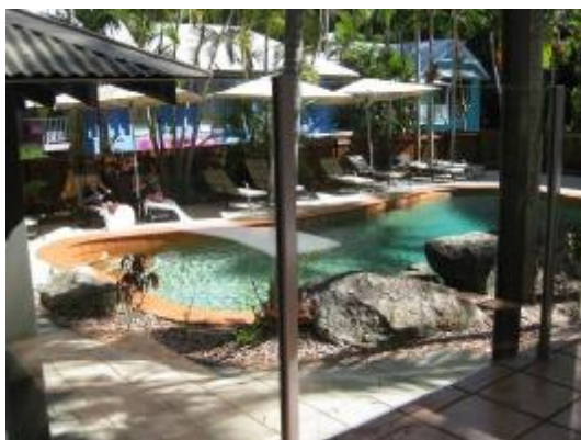
Pool view from balcony