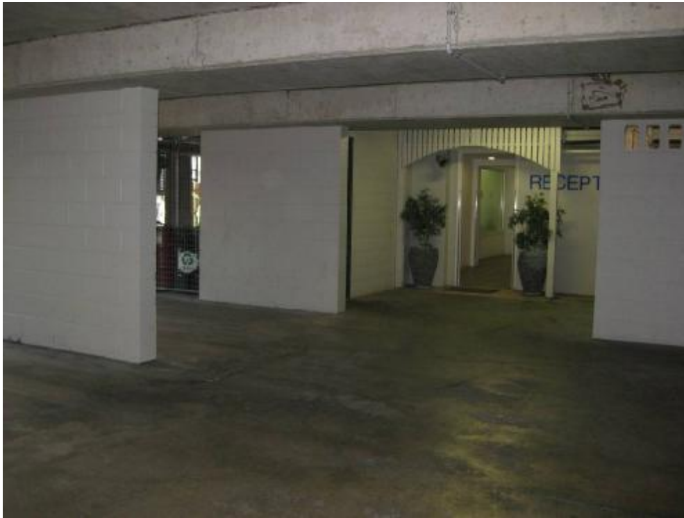
Undercover car parking area