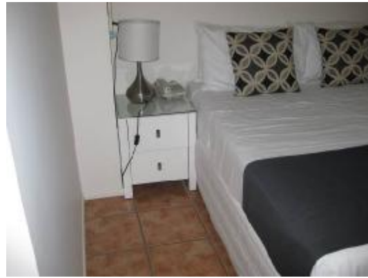
Double bed configured annex