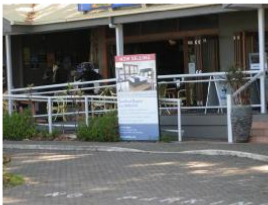
Ramp leading to Reception

Reception is a level tiled area with ample seating. The reception counter does not have a lowered section for wheel chairs but staff will assist guests if required.