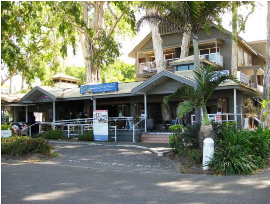
Paradise On the Beach, Palm Cove

Room numbers: One accessible room no interconnecting rooms