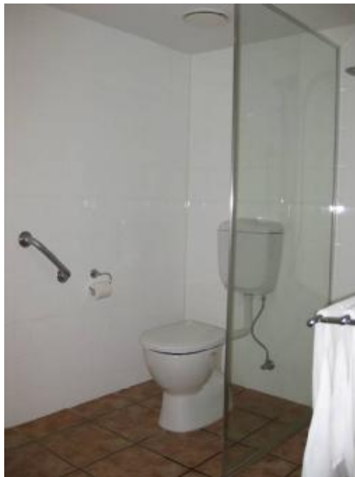
Toilet grab rail configuration