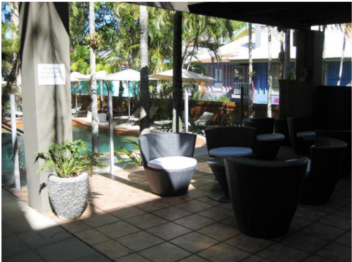
Pool deck area looking down on the pool

There is good access to the upper pool deck, The pool at this stage is not accessible due to steps down into the pool area. The resort are looking to rectify this in the future.