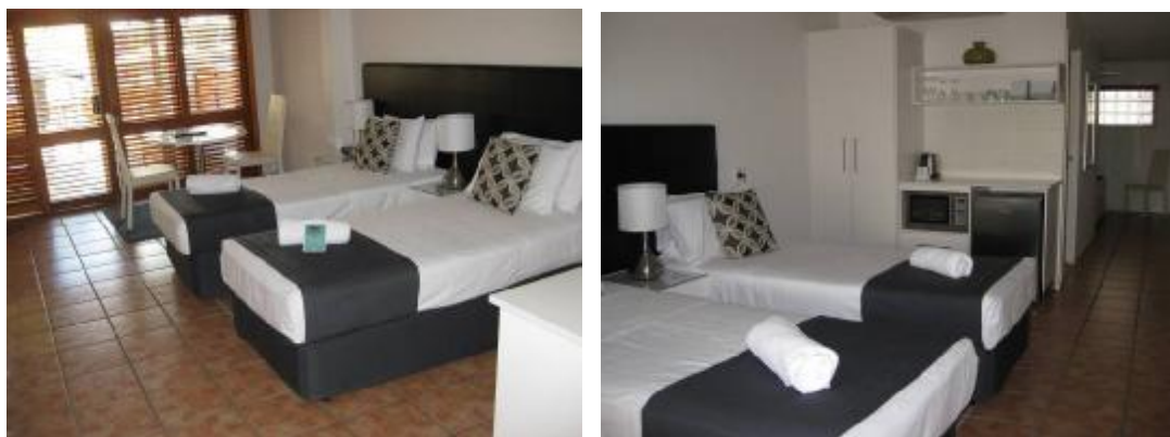
Single bed configuration

The room balcony is easily accessible with a recessed track. The balcony overlooks the resort pool and is very spacious with comfortable furniture to lounge in.