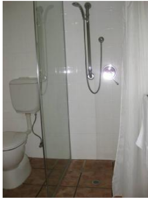
Shower and screen configuration