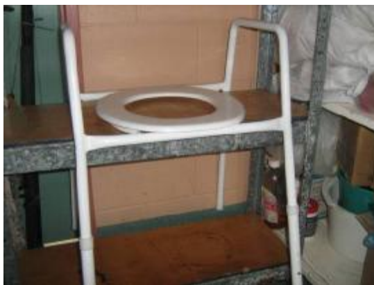
Portable shower chair

Staff are very friendly and will assist with baggage if required. Assistance dogs are welcome on the premises.