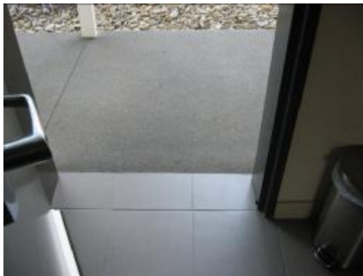
Level entry into accessible room