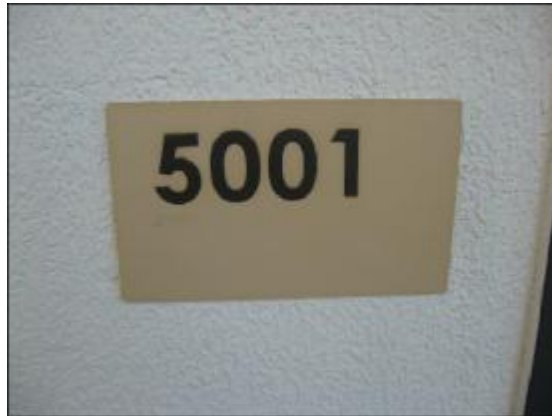
Accessible room doors showing contrasting numbering and Braille on room numbers