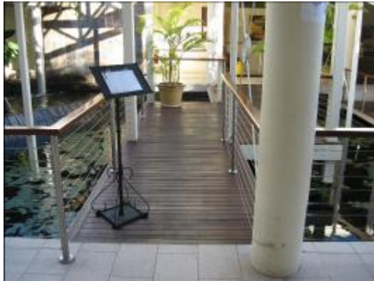
Access to Sakinah House restaurant

There is good level access to and from the dining area. There is 1280mm clear space at the entry and exit points.