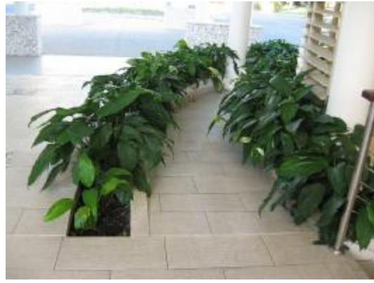
top of reception entry ramp