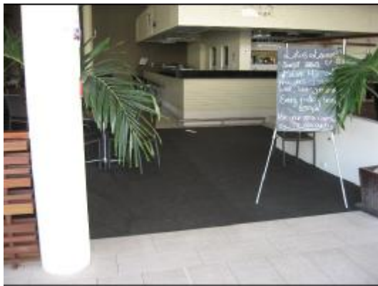
Access to lower level of Lotus Lounge