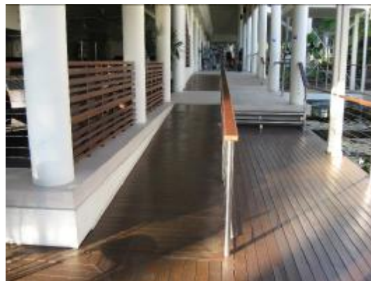
Access to Palm Garden from reception