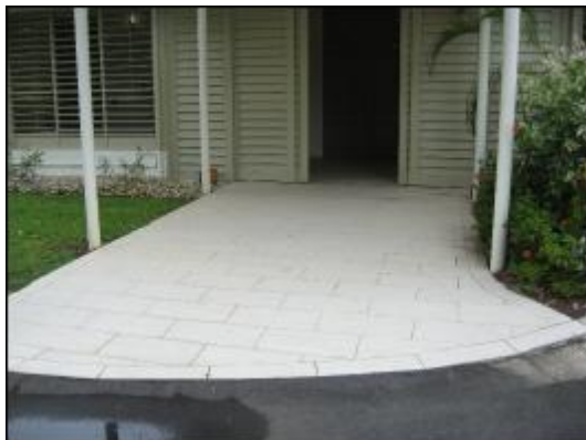
Access to Grand Ballroom