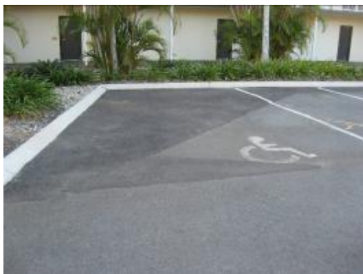
Accessible car park

If travelling by coach or taxi there is an accessible set down area immediately in front of the resort.