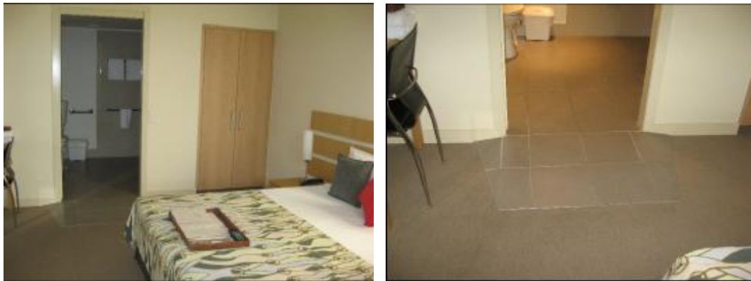
Entry into accessible bathroom

Clearance to the under side of the sink is 650mm with a top height of 790mm. The base of the mirror is 900mm from the floor.