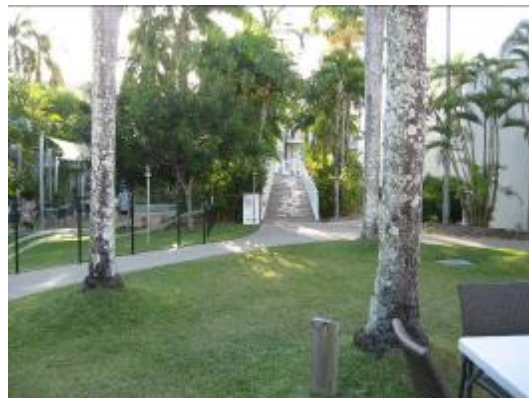
Access to second floor Block 4