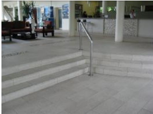
Steps leading to reception