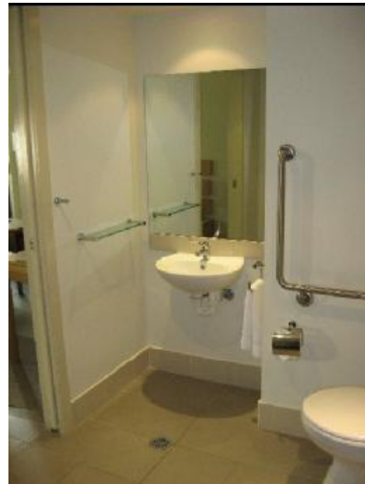
Access to sink