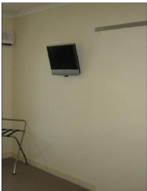
Flat screen TV