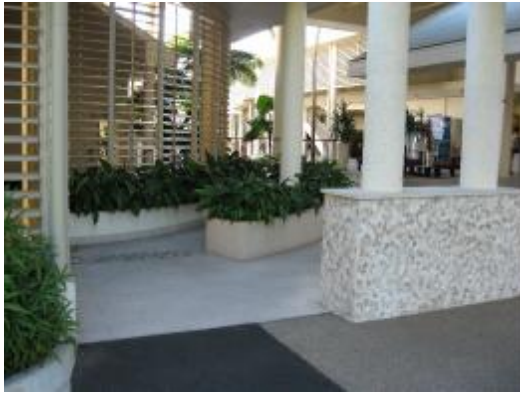
Bottom of reception entry ramp