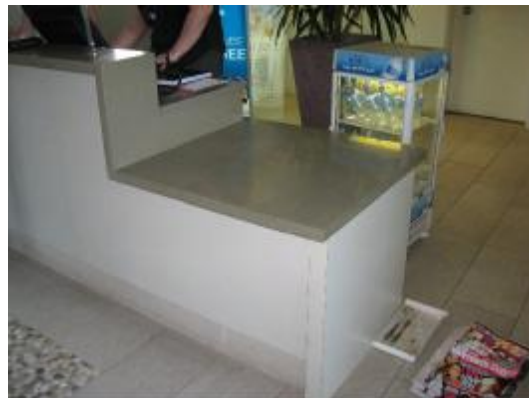
Lowered accessible counter