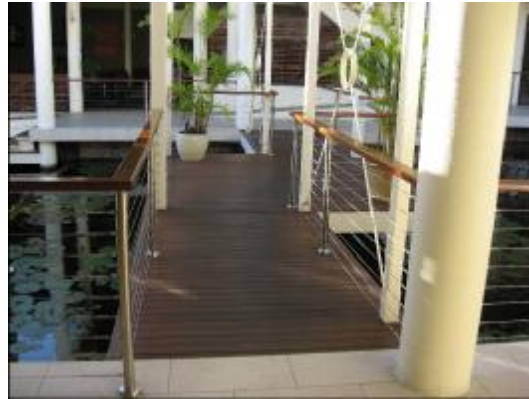
Access from Sakinah House restaurant