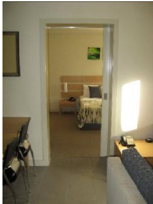
Entry into accessible bedroom