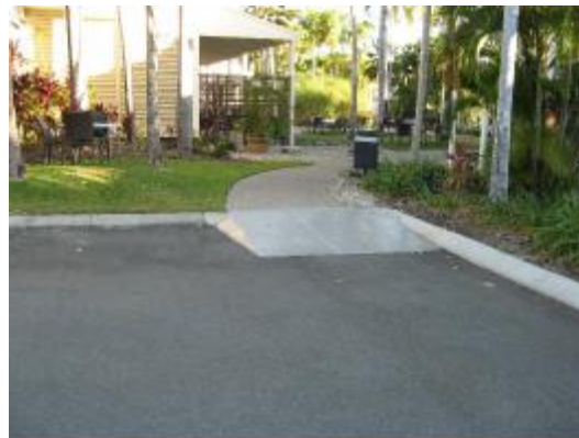
Access ramp from car park to resort