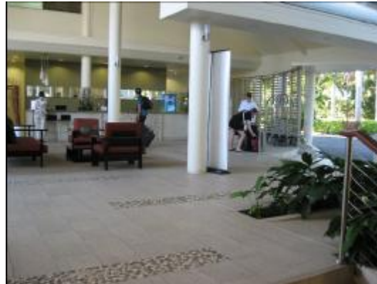
Reception viewed from top of ramp