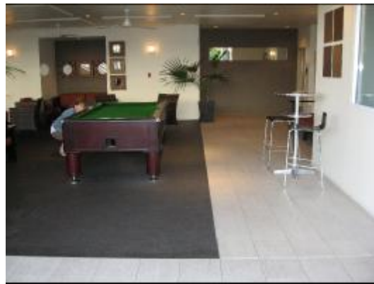
Access to upper level of Lotus Lounge