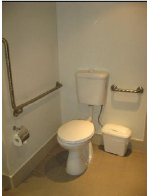
Accessible toilet and grabrails