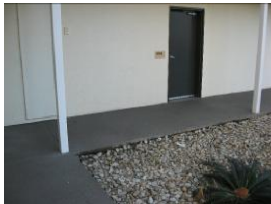
Access paths leading to accessible rooms