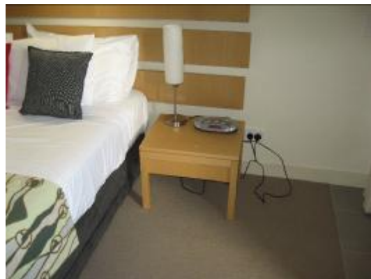
Clear space at main bed