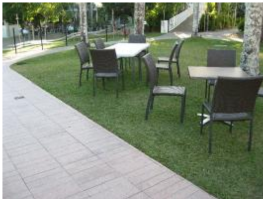
Access to Palm Garden