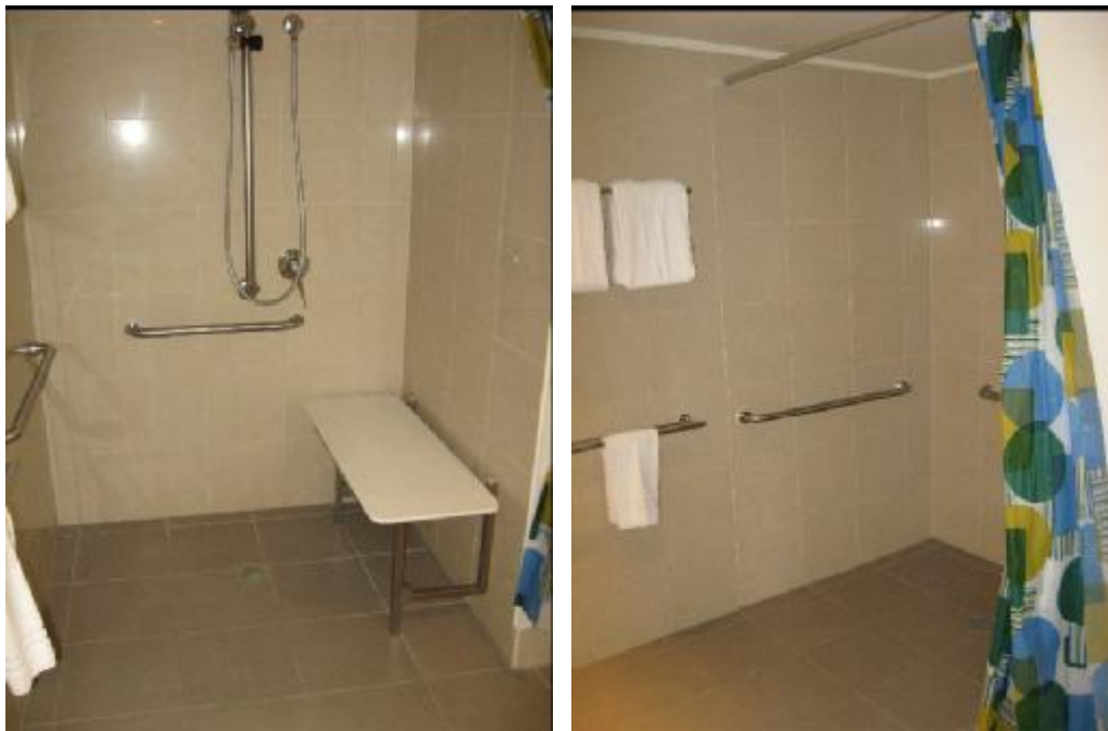
Accessible roll-in shower