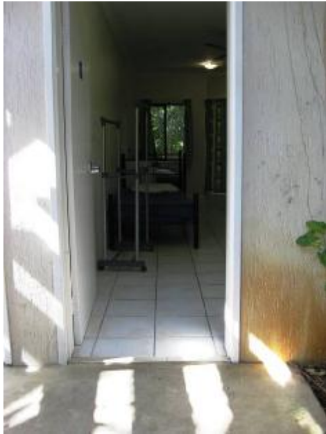
Entry into accessible room