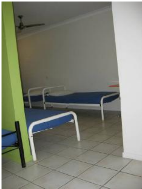
Divider between sets of beds