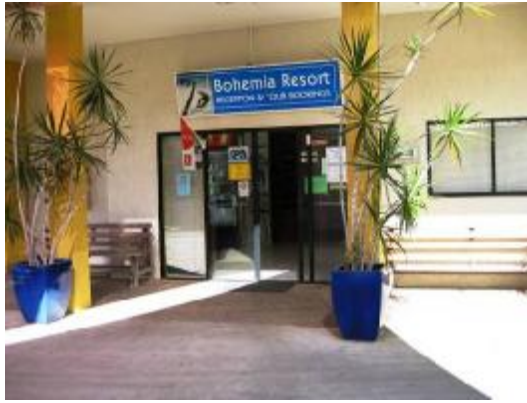
Level entry into reception