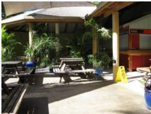
Relaxed outdoor area near pool