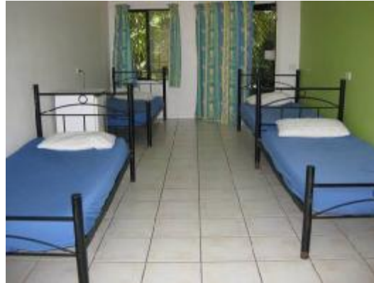
Bed layout in room