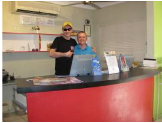
Reception counter and friendly staff